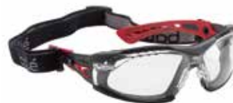
RUSHPFSPSI (Rush+ clear with foam & strap)