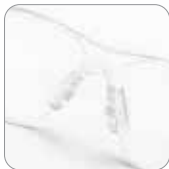
Non-slip adjustable bridge